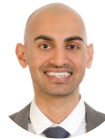
Neil Patel, neilpatel.com